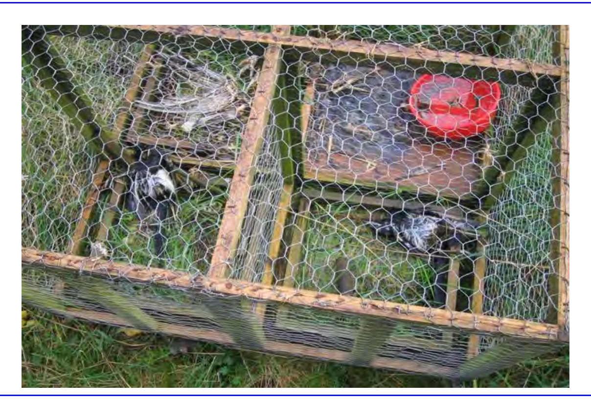
Pheasant with head injury in Larsen May 2016 West Sussex

All these birds found dead , High Salvington December 2009